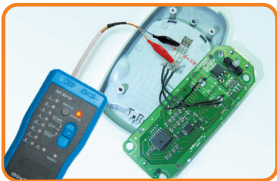
test positive and negative pole of DC electric level

Push DIP switch on emitter to position of “SCAN” , press function switchover button on emitter for 2 seconds, “STATUS” indicator will turn off and “VERIFY” indicator flashes, insert the crystal plug of crocodile clamp into RJ11, clamp the two ends of cable with crocodile clamps, in case that “STATUS” indicator lights up in red , it means the end clamped by red clamp is positive pole, in case that “STATUS” indicator lights up in green, it means the end clamped by red clamp is negative pole, electric level can be judged by brightness of the status indicators; the lighter the indicator, the higher the level is; the darker, the lower.